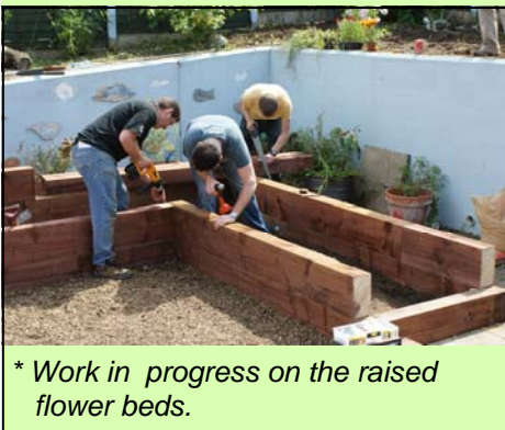
* Work in progress on the raised flower beds.

The charity has been building a relationship with the Salesforce.com Foundation for the past four years, initially by using the company's software and more recently its volunteer projects.